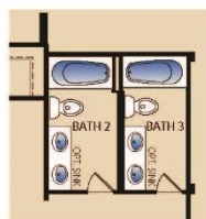
OPT. BATH 3