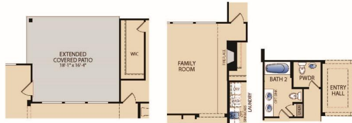
OPT. EXTENDED COVERED PATIO