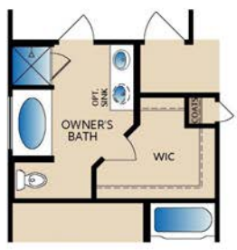
OPT. OWNER'S BATH 2