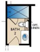
OPT. BATH 2