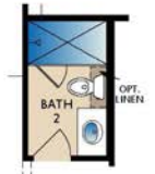
OPT. BATH 2