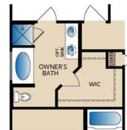
OPT. OWNER'S BATH 2