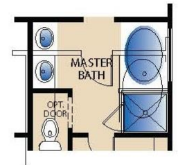
OPT. TUB AT MASTER BATH