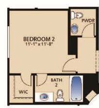
OPT. POWDER ROOM