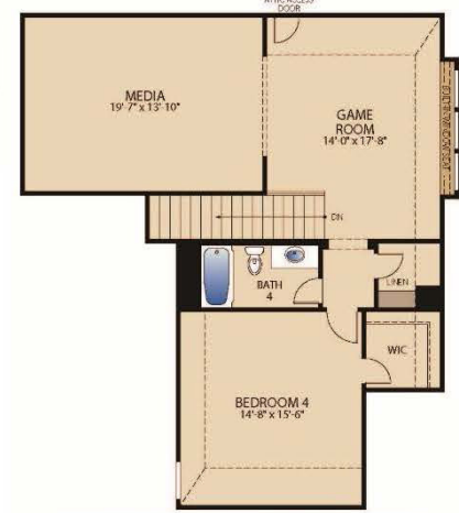
SECOND FLOOR PLAN W/ OPTIONAL MEDIA