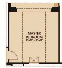
OPT. CATHEDRAL CEILING AT MASTER BEDROOM