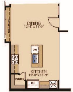
OPT. DELUXE KITCHEN