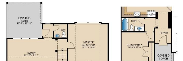
OPT. EXTENDED COVERED PATIO