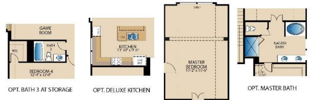
OPT. BATH 3 AT STORAGE