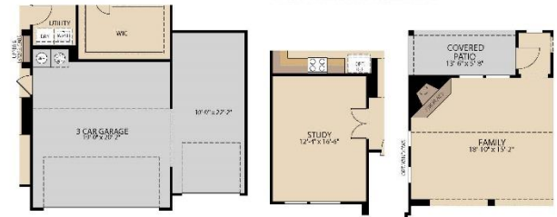
OPT. 3 CAR GARAGE