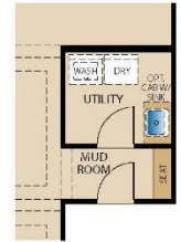
OPT. MUD ROOM