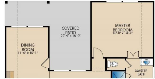
OPT. COVERED PATIO