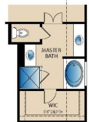
OPT. DELUXE M BATH