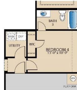
OPT. BEDROOM 4 AT TANDEM GARAGE