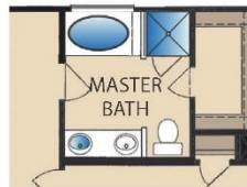
Optional 2nd Master Bath with Shower & Oval Tub