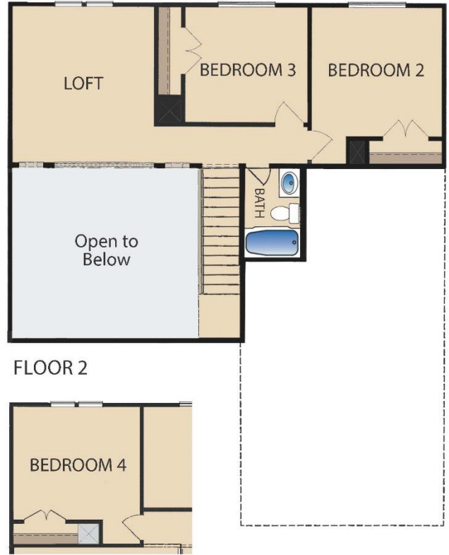
Optional Bedroom 4