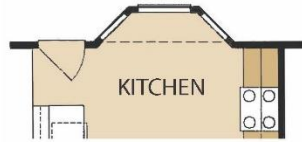
Optional Kitchen Bay Window