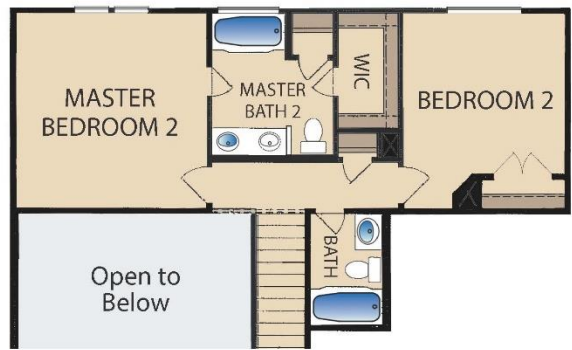
Optional 2nd Master with 2nd Master Bath Upstairs