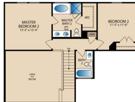
OPT. MASTER SUITE 2 (IN LIEU OF LOFT AND BEDROOM 3)