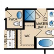
OPT. MASTER BATH