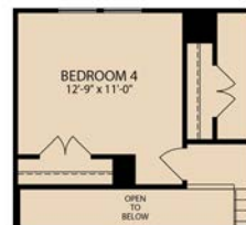
OPT. BEDROOM 4 (IN LIEU OF LOFT)