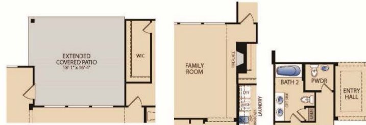
OPT. EXTENDED COVERED PATIO