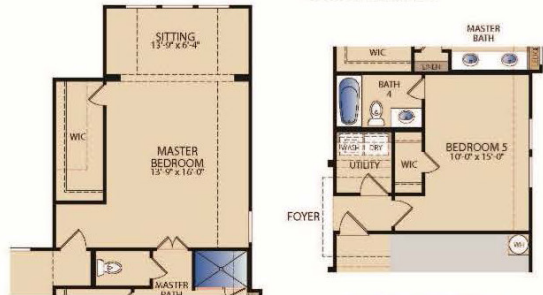
OPT. MASTER SITTING