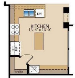
OPT. DELUXE KITCHEN