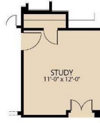
OPT. STUDY I/O BEDROOM 3