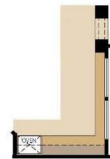
OPT. CABINETS @ KITCHEN