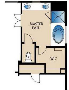
OPT. DELUXE MASTER BATHROOM