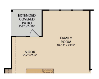
OPT. EXTENDED FAMILY ROOM & COVERED PATIO