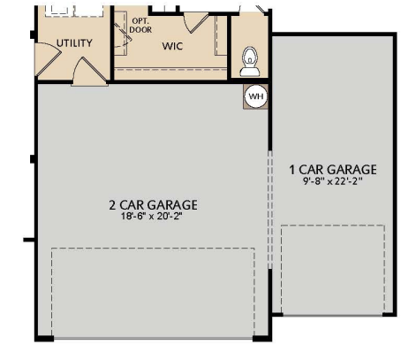
OPT. 3 CAR GARAGE