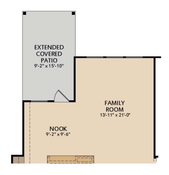
OPT. EXTENDED FAMILY ROOM & EXTENDED COVERED PATIO