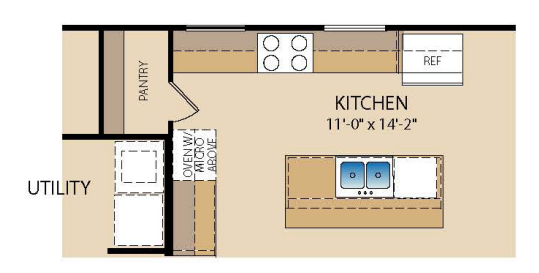
OPT. DELUXE KITCHEN