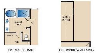
OPT. MASTER BATH