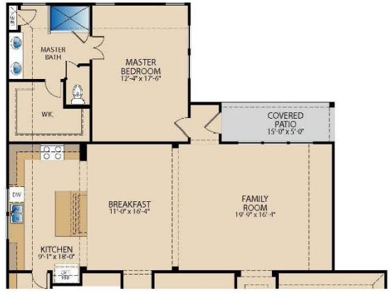
OPT. EXTENDED COVERED PATIO 1