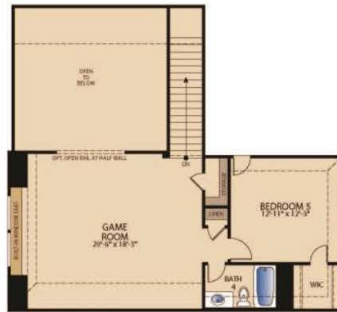
OPT. SECOND FLOOR W/ GAMEROOM BEDROOM 5 & BATH