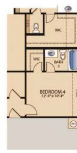
OPT BEDROOM 4 W/