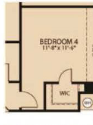
OPT. BEDROOM 4 I/O STUDY