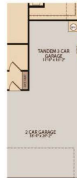
OPT TANDEM GARAGE