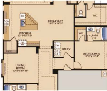
OPT. DINING AT BEDROOM 2 AND BEDROOM 4 W/ BATH AT STUDY