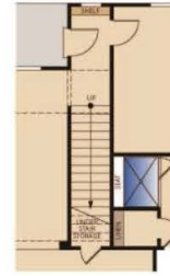
FIRST FLOOR PLAN W/ OPT. SECOND FLOOR