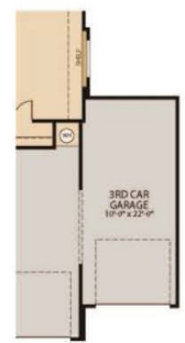
OPT 3 RD CAR GARAGE

Updated 05/2019 © Pacesetter Homes, LLC. Unauthorized use of this plan is a violation of the U.S. Copyright Act Title 17 of the U.S. Code. Floorplans and Elevations are subject to change without notice. The Floorplans and Elevations represented are artistic concepts. The actual construction plan may differ in features, dimensions, and colors offered. All square footage is approximate living area. Your Pacesetter representative will be happy to provide specific and current details.