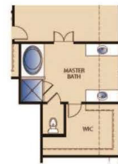
OPT. MASTER BATH