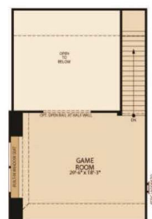
OPT. SECOND FLOOR W/ GAMEROOM