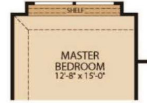
OPT. WINDOW SEAT AT MASTER BEDROOM