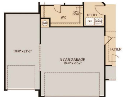
OPT. 3 CAR GARAGE

Updated 06/2021. © Pacesetter Homes, LLC. Unauthorized use of this plan is a violation of the U.S. Copyright Act Title 17 of the U.S. Code. Floorplans and Elevations are subject to change without notice. The Floorplans and Elevations represented are artistic concepts. The actual construction plan may differ in features, dimensions, and colors offered. All square footage is approximate living area. Your Pacesetter representative will be happy to provide specific and current details.