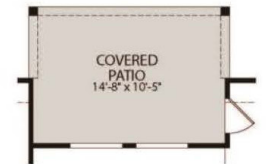
OPT. EXTENDED COVERED PATIO