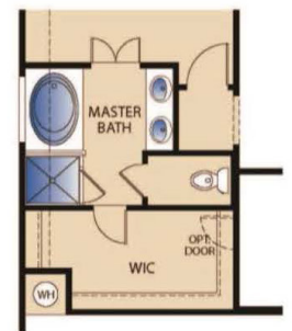
OPT. MASTER BATH