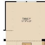
OPT. EXPANDED FAMILY