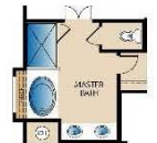
OPT. DELUXE MASTER BATH