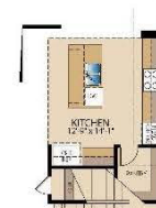
OPT. DELUXE KITCHEN