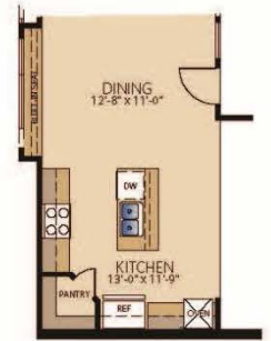
OPT. DELUXE KITCHEN