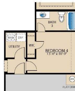
OPT. BEDROOM 4 AT TANDEM GARAGE