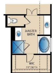
OPT. DELUXE M BATH