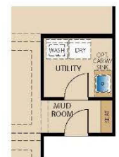
OPT. MUD ROOM