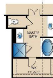
OPT. DELUXE M BATH