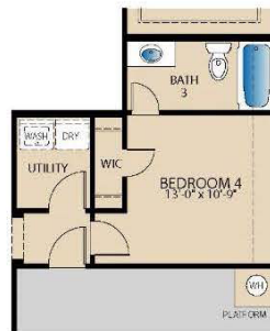
OPT. BEDROOM 4 AT TANDEM GARAGE