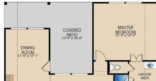
OPT. COVERED PATIO