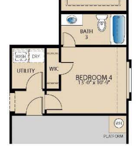
OPT. BEDROOM 4 AT TANDEM GARAGE