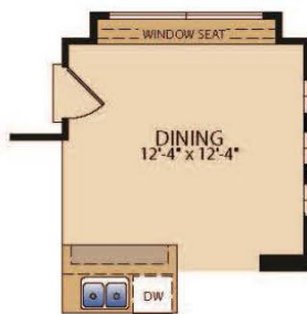
OPTIONAL WINDOWS AT DINING