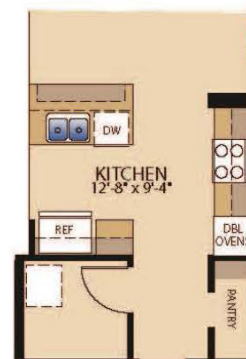
OPTIONAL DELUXE KITCHEN