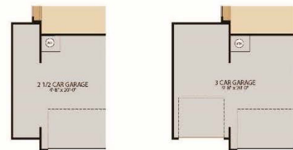
OPT. 2 1/2 CAR GARAGE