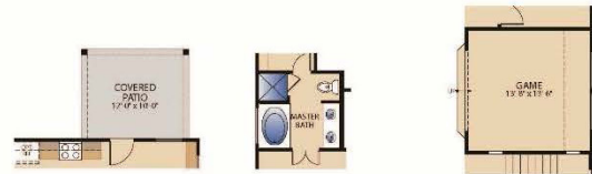
OPT. COVERED PATIO