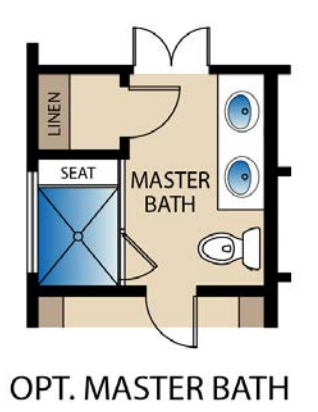
© Pacesetter Homes, LLC. Unauthorized use of this plan is a violation of the U.S. Copyright Act Title 17 of the U.S. Code. Floorplans and Elevations are subject to change without notice. The Floorplans and Elevations represented are artistic concepts. The actual construction plan may differ in features, dimensions, and colors offered. All square footage is approximate living area. Your Pacesetter representative will be happy to provide specific and current details. Updated 06/02/2021.