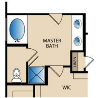
OPT. MASTER BATH