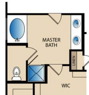
OPT. MASTER BATH