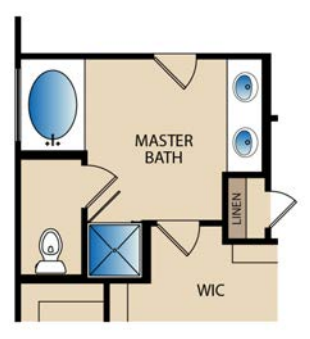
OPT. MASTER BATH