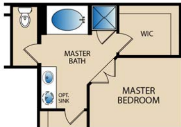
OPT. MASTER BATH