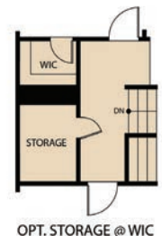
OPT. STORAGE @ WIC