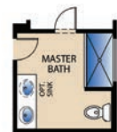
OPT. SHOWER AT MASTER BATH