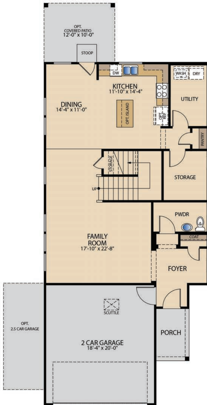
FIRST FLOOR 41979 HARTLEY