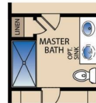
OPT. DELUXE MASTER BATH