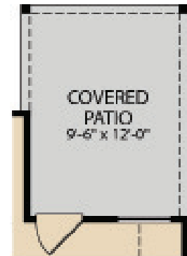
OPT. EXTENDED COVERED PATIO