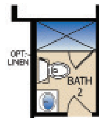
OPT. SHOWER AT BATH 2