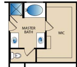
OPT. MASTER BATH