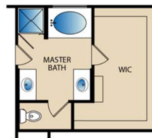
OPT. MASTER BATH