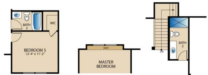
OPT. BEDROOM 5 AT DINING