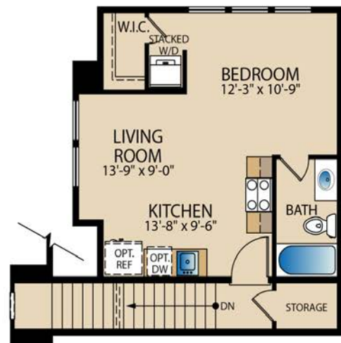
OPT. ADU - SECOND FLOOR