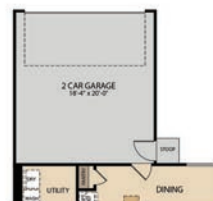
OPT. ATTACHED GARAGE