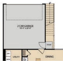
FIRST FLOOR W/ OPT. APARTMENT ABOVE ATTACHED GARAGE