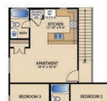
SECOND FLOOR W/ OPT. APARTMENT ABOVE GARAGE