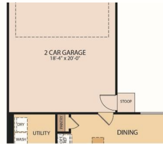
OPT. ATTACHED GARAGE