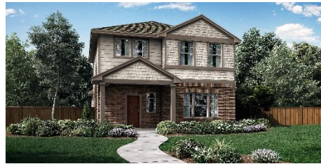
Bailey B with optional masonry