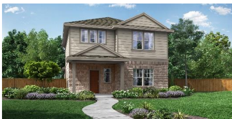
Bailey C with optional masonry