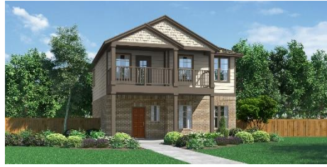
Bailey E with optional masonry