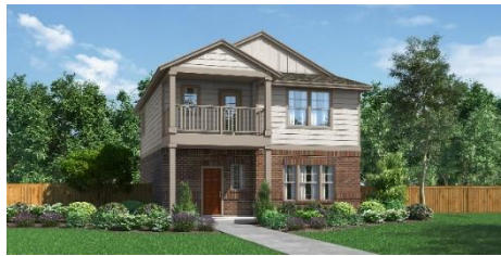
Bailey D with optional masonry