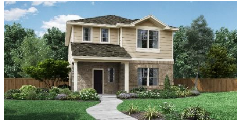
Bailey A with optional masonry