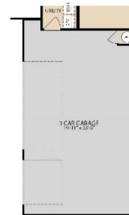
OPT. 3 CAR GARAGE 1