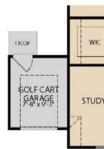
OPT. GOLF CART GARAGE