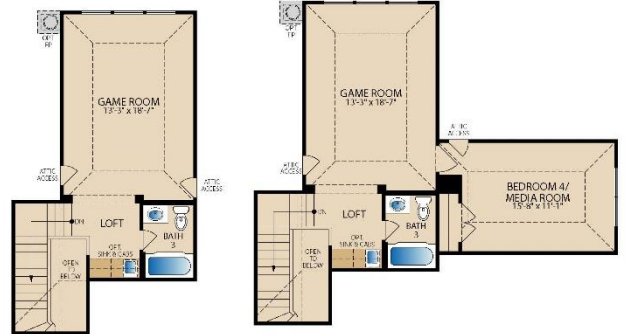
OPT. BATH 3