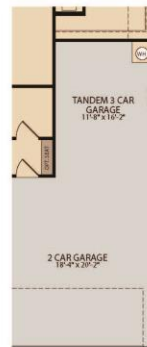
OPT. TANDEM GARAGE