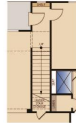
FIRST FLOOR PLAN W/ OPT. SECOND FLOOR