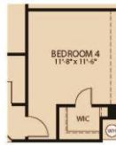
OPT. BEDROOM 4 I/O STUDY