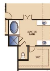
OPT. MASTER BATH