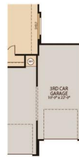
OPT. 3 CAR GARAGE