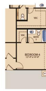
OPT. BEDROOM 4 W/ BATH AT STUDY