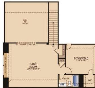
OPT. SECOND FLOOR W/ GAMEROOM BEDROOM 5 & BATH