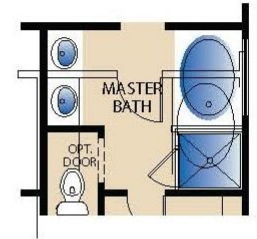
OPT. TUB AT MASTER BATH