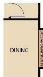
OPT. WINDOW SEAT AT DINING