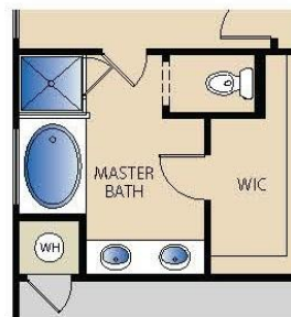
OPT. TUB AT MASTER BATH