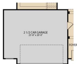
OPT. 2 1/2-CAR GARAGE