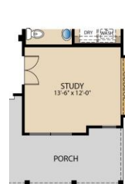
OPT. STUDY AT DINING