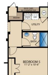
OPT. BEDROOM 5 AT DINING