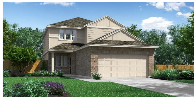
Walker B with masonry