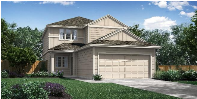
Walker B with siding