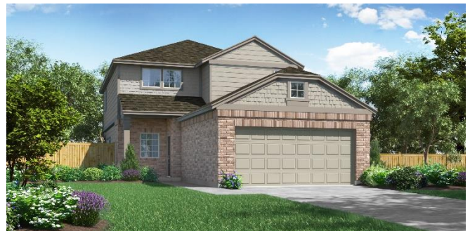
Walker A with masonry