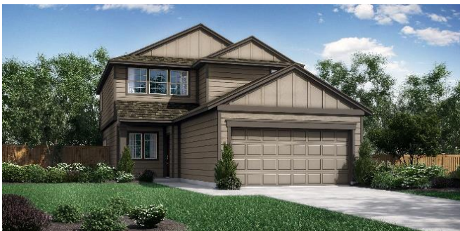
Walker C with siding