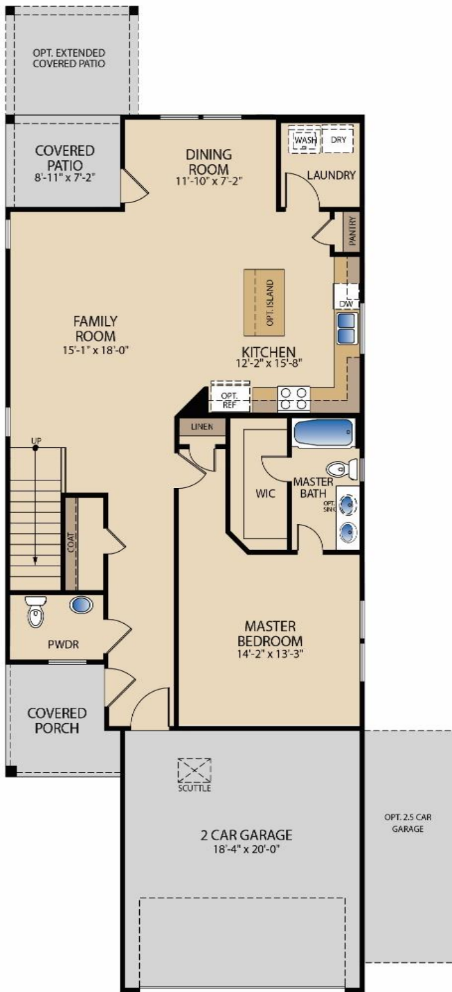
FIRST FLOOR 42242 WALKER

Plan 42242 | 2 Story | 4 Bedrooms | 2.5 Bathrooms