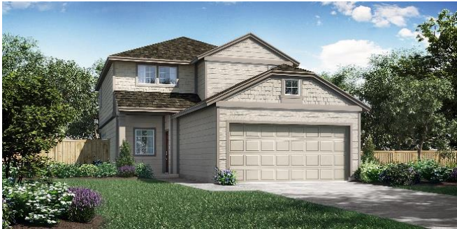
Walker A with siding