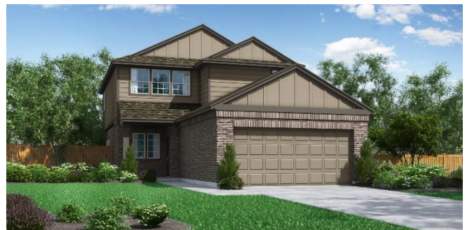
Walker C with masonry