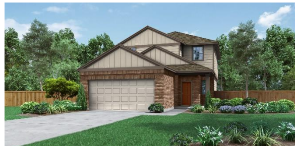
Hartley C with optional masonry