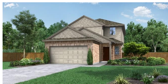
Hartley B with optional masonry