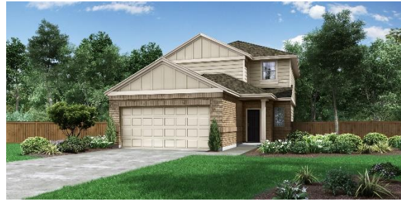
Hartley A with optional masonry