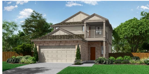
Hartley D with optional masonry