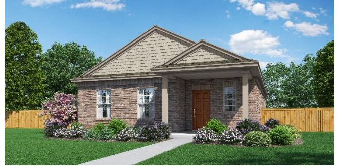
Hamilton A with optional masonry