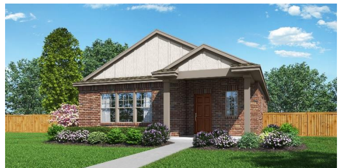
Hamilton C with optional masonry