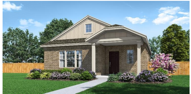
Hamilton B with optional masonry