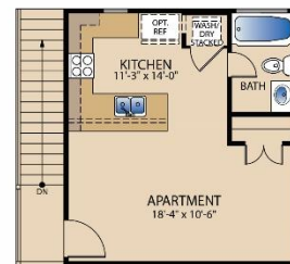
SECOND FLOOR W/ OPT. APARTMENT ABOVE DETACHED GARAGE