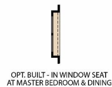
OPT. BUILT - IN WINDOW SEAT AT MASTER BEDROOM & DINING