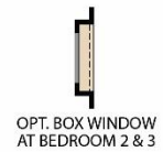
OPT. BOX WINDOW AT BEDROOM 2 & 3