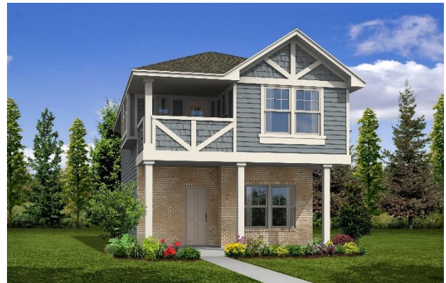
Andrews M w/ optional masonry