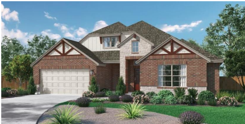
Fairview I B