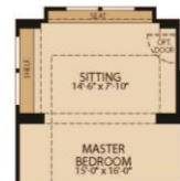
OPT. SITTING AT MASTER BEDROOM