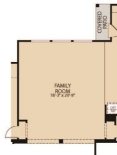
OPT. TRANSOMS & COVERED PATIO