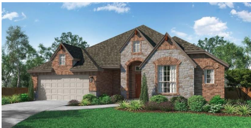
Fairview I C