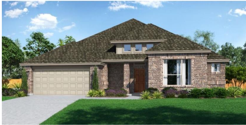
Fairview I A