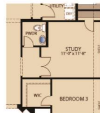
OPT. PWDR BATH