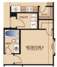
OPT. BEDROOM 4 AT STUDY