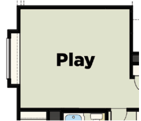
Optional Gameroom @ Bedroom 2