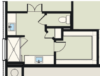
Optional Extended Shower @ Master bath