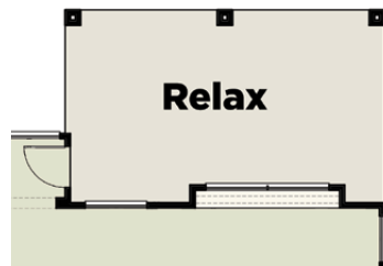
Optional Extended Covered Patio