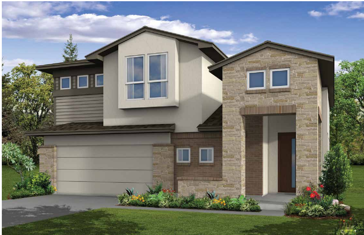
Front Elevation D