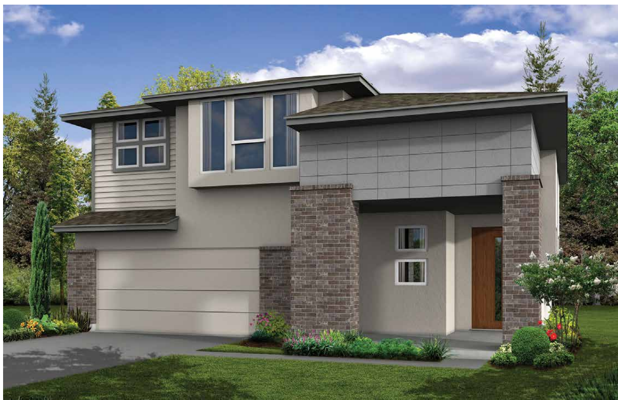
Front Elevation E