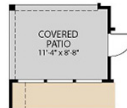
OPT. COVERED PATIO