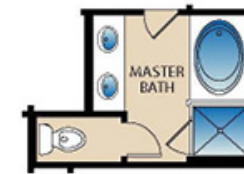
OPT. DELUXE MASTER BATH