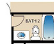
OPT. WINDOW AT BATH 2